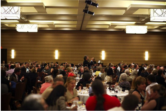
A sea of supporters of fair and affordable housing

The 2010 Annual Meeting was made possible with the generous support of our sponsors. We want to thank them for all the hard work they do to make our community a wonderful place to live and work.